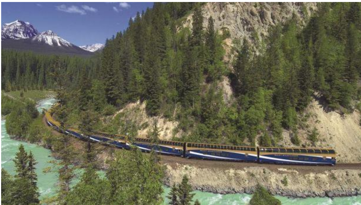
Kicking Horse Canyon, Canadian Rockies.

No experience quite captures the majesty of Canada's Rocky Mountains like its most famous train, the Rocky Mountaineer. This is so much more than a rail journey. Yes, you'll make your way by train from Vancouver into the mountains proper, passing otherwise inaccessible high-altitude lakes, rolling through mountain passes, and maybe even catching sight of native wildlife by the side of the track. But the Rocky Mountaineer is also about the experience on board: the luxury of this beautiful train, of the panoramic windows, the great food and the five-star service. It's perfection in and out.