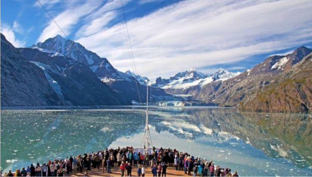
Glacier Bay, Canada.

There really is no other way to discover the Inside Passage of Alaska than by ship. There's no other way to get into the small inlets and bays; no other way to witness the wild, rugged coastline than to approach it by sea. It takes seven days of cruising to see this area properly, to call into outposts such as Juneau and Skagway and learn about their indigenous culture and heritage, to witness glacial calving in the world heritage-listed Glacier Bay National Park, and to see the fjords and the tiny islands that dot the coastline off British Columbia.