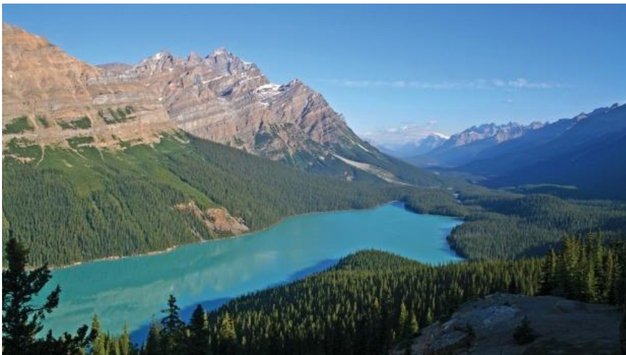
View from Portal Peak, Mount Thompson, Canada.