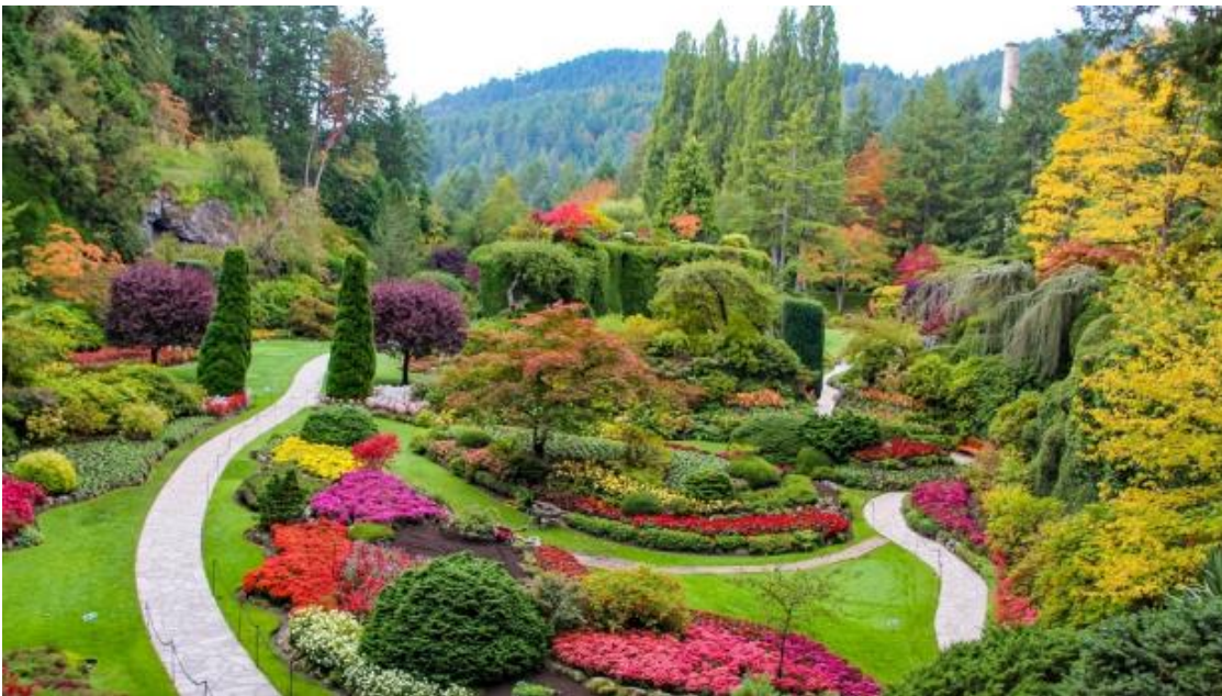
The Butchart Gardens.

Fancy a stroll? The town of Victoria, in British Columbia, is the ideal spot to indulge in a walk. This charming town has everything you could want for a few hours of pavement-based adventure, including plenty of boutiques and clothing stores, cafes and restaurants that make the most of the excellent local produce, a fascinating museum, and a lovely park down by the seafront. In Victoria there's also the option to take a horse-drawn carriage ride, or go on a guided tour of the city's heritage district.