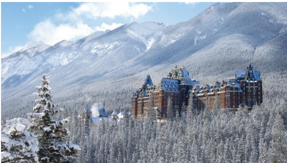
Fairmont Banff Springs Hotel.