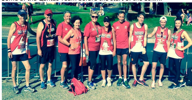
The Qantas Team group photo after the event.