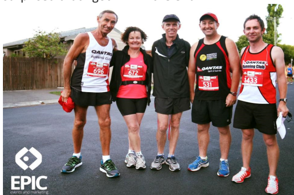
Some of the Qantas Team before the start of the 10km.