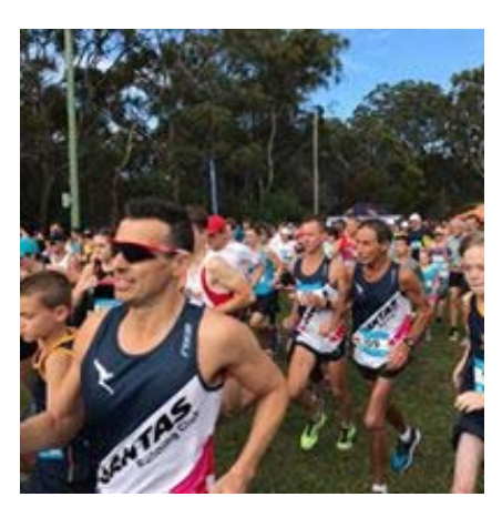
The Club runners at the recent Oatley Fun run.